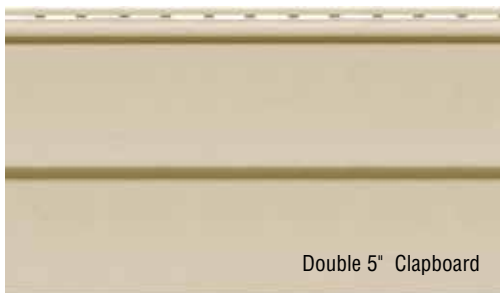
Double 5" Clapboard