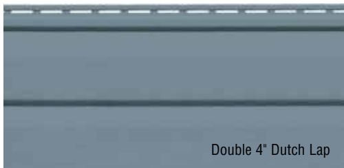
Double 4" Dutch Lap