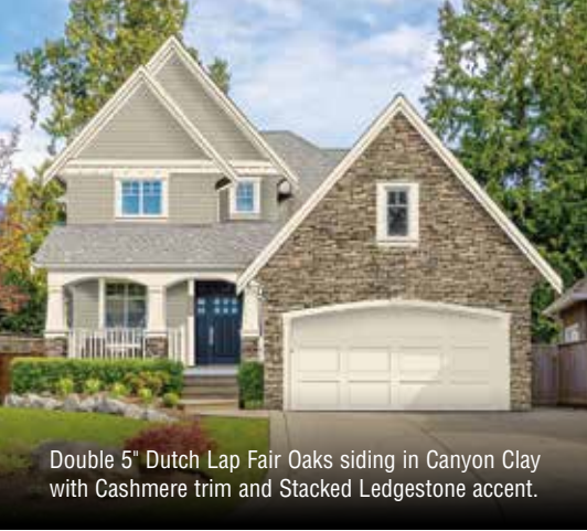
Double 5" Dutch Lap Fair Oaks siding in Canyon Clay with Cashmere trim and Stacked LedgeStone accent.