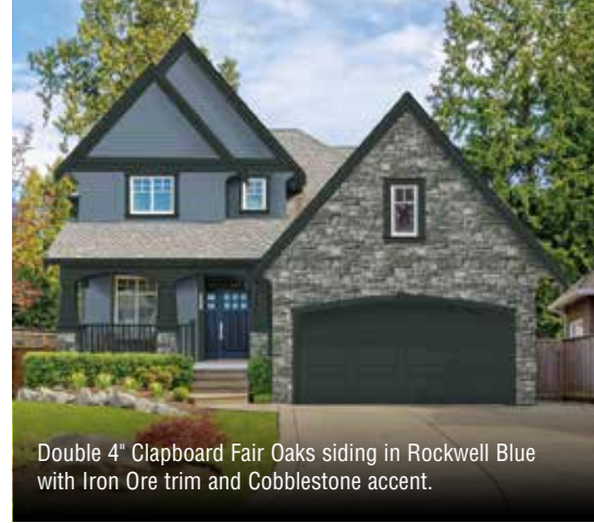
Double 4" Clapboard Fair Oaks siding in Rockwell Blue with Iron Ore trim and Cobblestone accent.