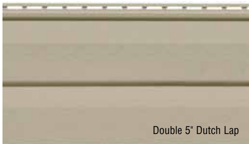
Double 5" Dutch Lap