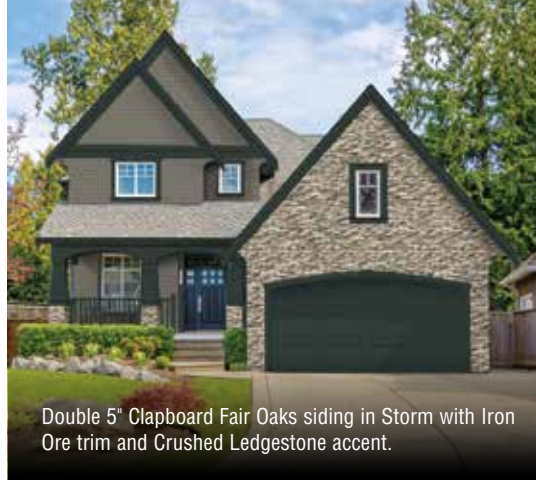
Double 5" Clapboard Fair Oaks siding in Storm with Iron Ore trim and Crushed LedgeStone accent.