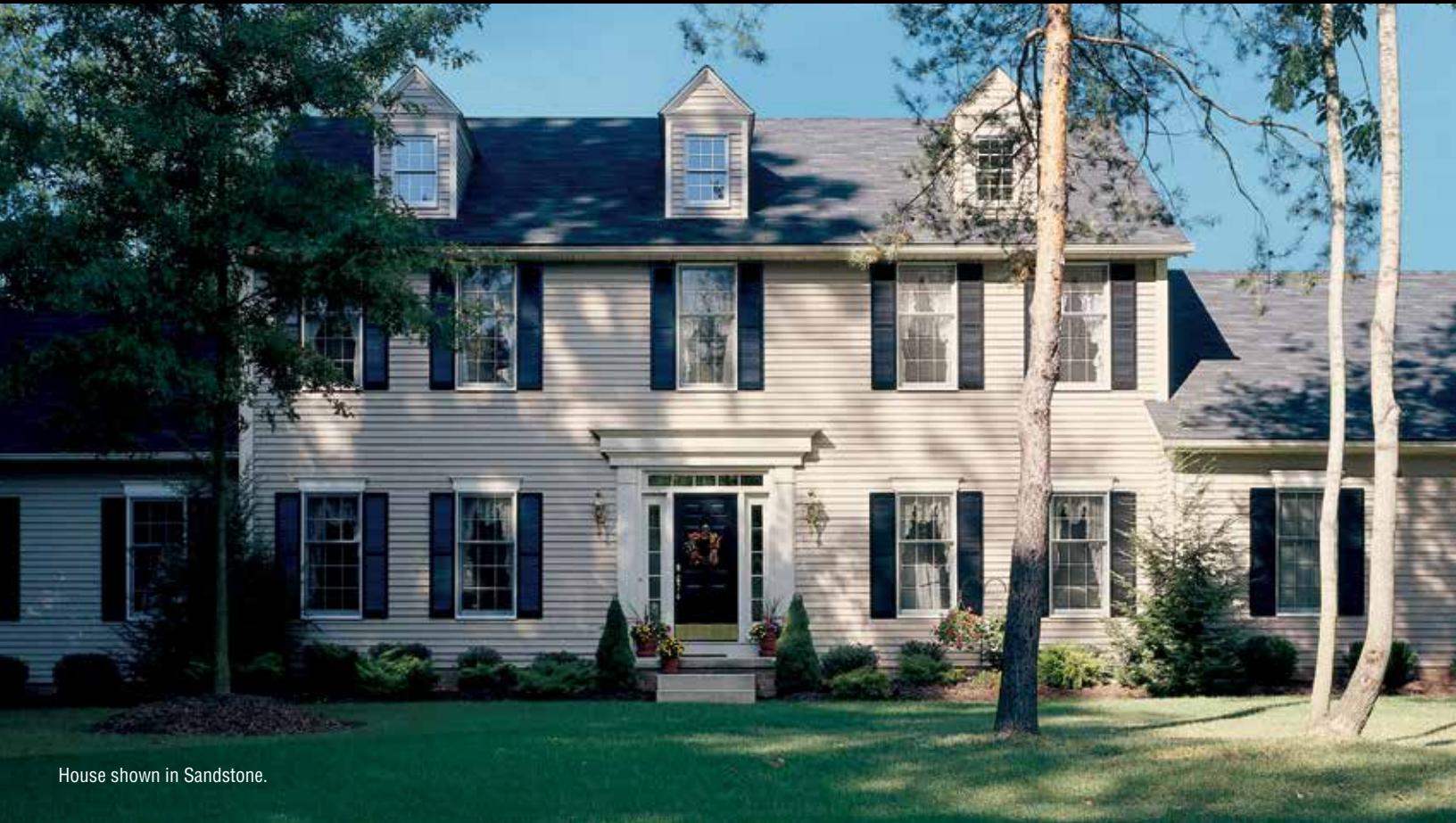
House shown in Sandstone.

At Gentek, every step of product design and development is rigorously tested to ensure superior performance. Built with best-in-class materials and cutting-edge technology, our sidings are expertly crafted to bring genuine quality, value and comfort to every home.