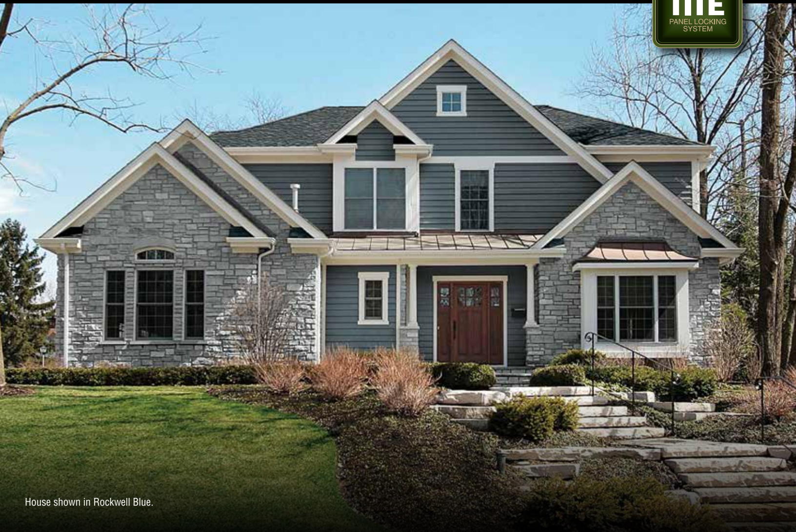
House shown in Rockwell Blue.

Featuring a heavy-duty panel thickness and substantial design upgrades, Fair Oaks delivers style and strength beyond ordinary vinyl siding.