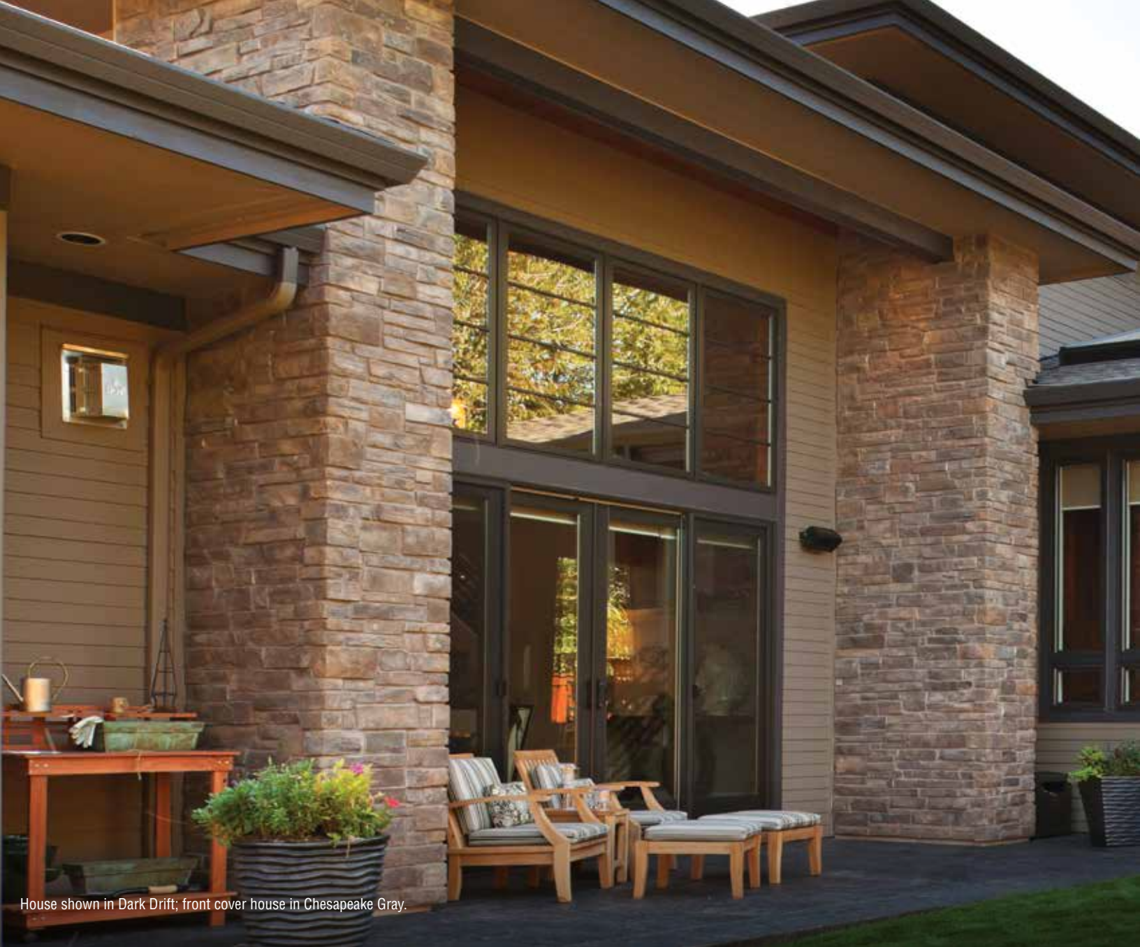
House shown in Dark Drift; front cover house in Chesapeake Gray.