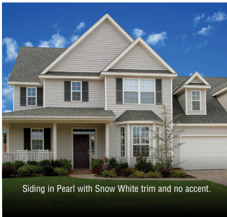
Siding in Pearl with Snow White trim and no accent.

No need to settle for siding and trim that "almost match." Our Colour Clear Through® collection of customer-preferred hues helps ensure a beautiful colour match with other Gentek siding, trim and accessory products.