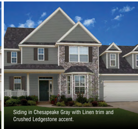
Siding in Chesapeake Gray with Linen trim and Crushed LedgeStone accent.