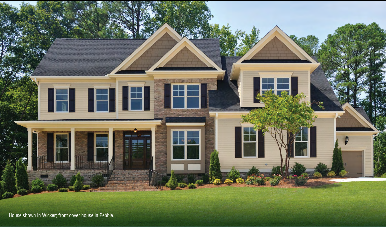
House shown in Wicker; front cover house in Pebble.

Beautifully crafted and value-priced, Driftwood II brings classic style to the forefront. The low-gloss finish, natural cedargrain texture and rich palette of colours will elevate the design potential of any home.