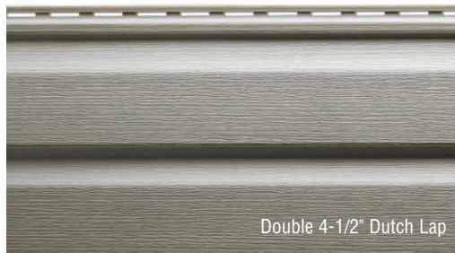
Double 4-1/2" Dutch Lap