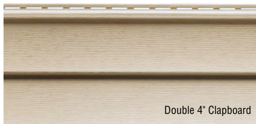
Double 4" Clapboard