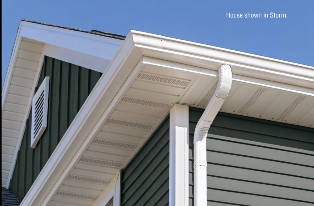
House shown in Storm.