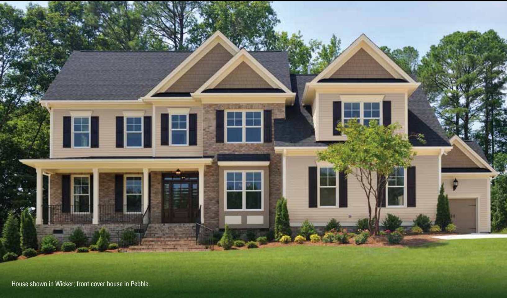
House shown in Wicker; front cover house in Pebble.

Beautifully crafted and value-priced, Driftwood II brings classic style to the forefront. The low-gloss finish, natural cedargrain texture and rich palette of colours will elevate the design potential of any home.