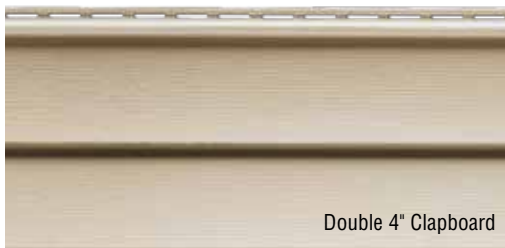
Double 4" Clapboard