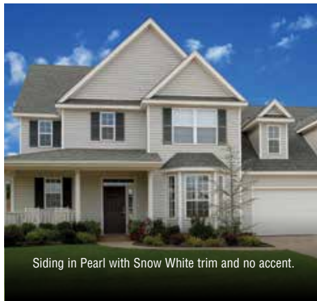
Siding in Pearl with Snow White trim and no accent.

No need to settle for siding and trim that "almost match." Our Colour Clear Through® collection of customer-preferred hues helps ensure a beautiful colour match with other Gentek siding, trim and accessory products.