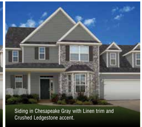
Siding in Chesapeake Gray with Linen trim and Crushed LedgeStone accent.