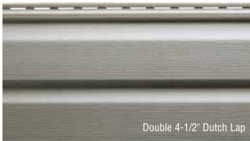
Double 4-1/2" Dutch Lap