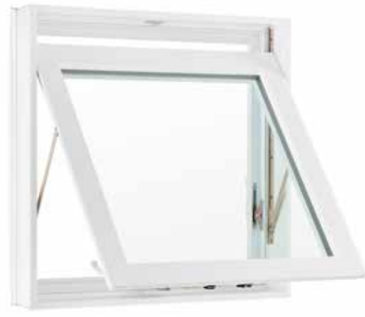
Awning windows can be combined with fixed lites to create a larger window group that offers ventilation.