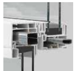
4 Internal Maxum33 steel lineal reinforcement at the sash interlock.