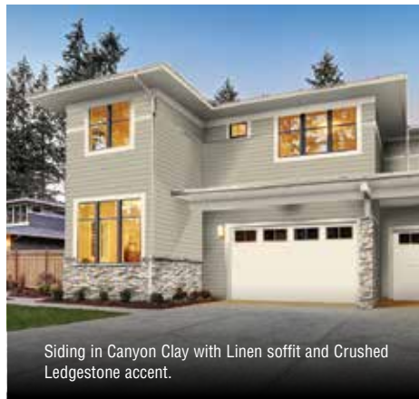
Siding in Canyon Clay with Linen soffit and Crushed LedgeStone accent.