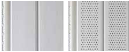
10" D-5 Solid Soffit/ Vertical Siding