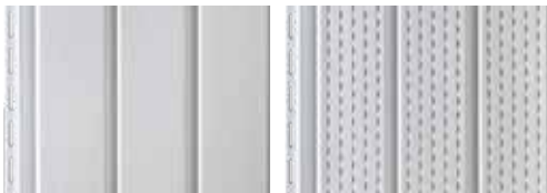
12" T-4 Solid Soffit/ Vertical Siding