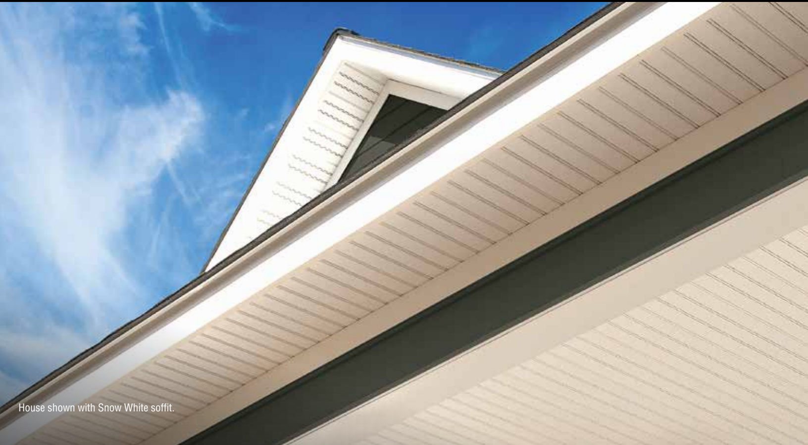
House shown with Snow White soffit.

Rooflines, gables and trim areas command extra attention when adding visual interest and dimension to the architecture of a home. At the same time, these important areas require proper ventilation to allow moisture to escape from the eaves and rafters.