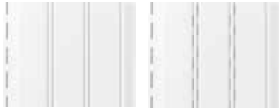
8" Solid Soffit