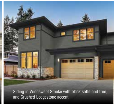
Siding in Windswept Smoke with black soffit and trim, and Crushed LedgeStone accent.

Featuring richer, darker colours fortified with ChromaTrue® fade-defying technology, Gentek vinyl soffit carries a lifetime limited warranty against fading. See printed warranty for complete details.