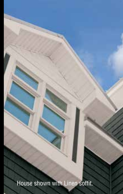
House shown with Linen soffit.

Built weather-tough, Gentek soffit will protect the hard-to-reach areas of your home with a resilient finish that never needs to be painted. Choose solid and vented profiles to create the ideal soffit system for your home.