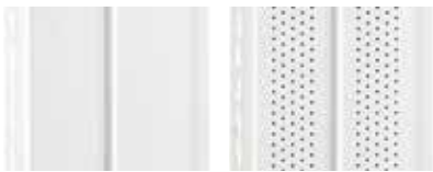
8" Solid Soffit