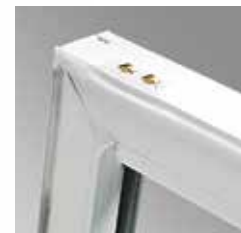
6 Solid brass tandem rollers.