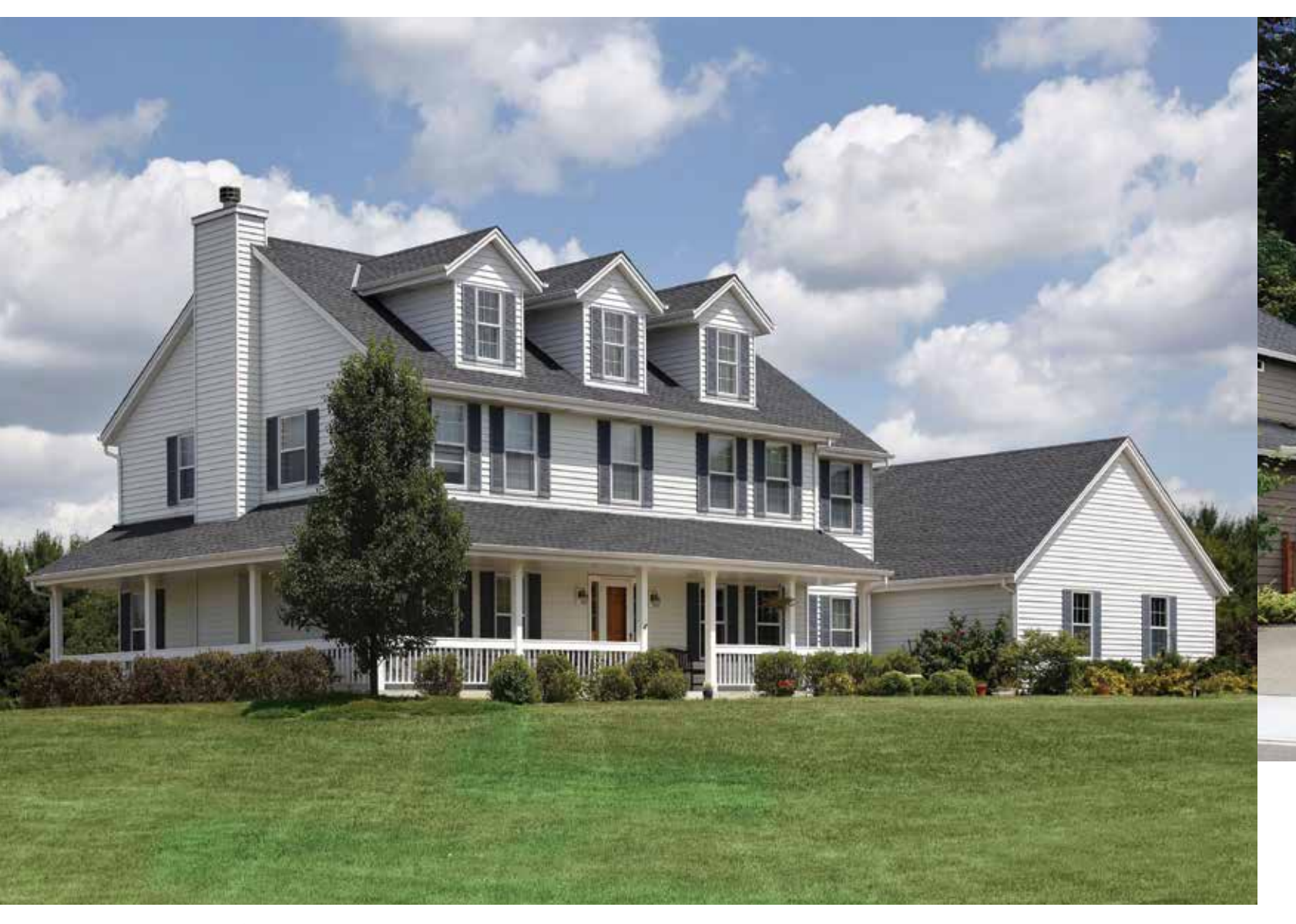
The traditional elegance of our Double 4", Double 5" and 8" Horizontal is accentuated with an inviting roughsawn texture. (Double 4" shown.)