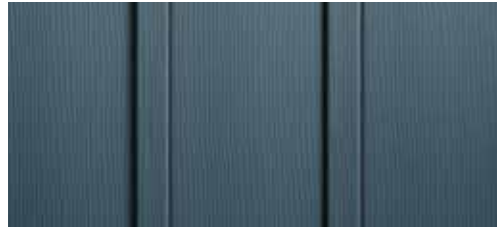
Cedar Mill Grain Texture