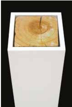
KLEERWrap POST WRAP Available in a variety of sizes. See chart above.