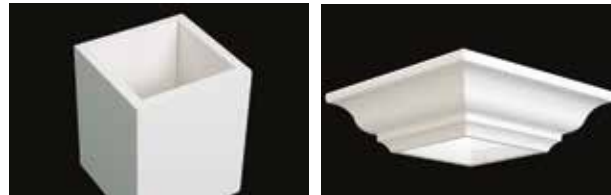
OUTER WRAP Available in 5", 7" and 12" lengths for 4", 6", 8" and 10" post wraps; 1/2" thick

KLEERWrap accessories are available for all post wrap sizes.