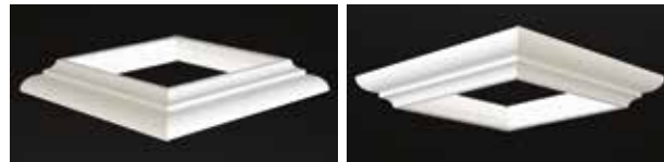
BED MOULDING SET Available for 4", 6", 8" and 10" post wraps