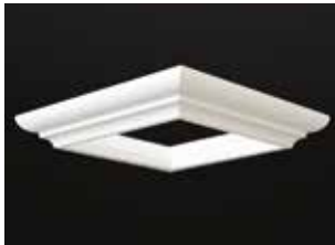
KLEERWRAP BED MOULDING SETS Included with Post Wrap and sold separately.