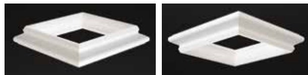
BASE CAP MOULDING SET Available for 4", 6", 8" and 10" post wraps