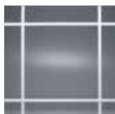
5/8" Standard Flat Prairie