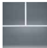
3/4" Contoured Craftsman