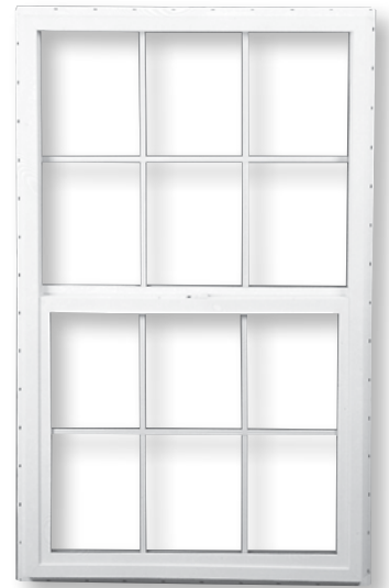
Single hung windows offer the best of both worlds – classic beauty and modern practicality.