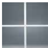
1" Contoured Colonial