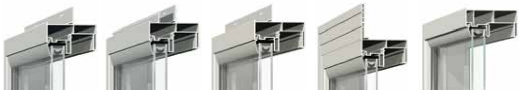
1-3/8" Set Back Nail Fin (standard)