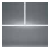
5/8" Standard Flat Craftsman