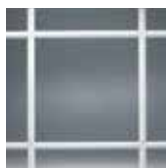
1" Contoured Prairie