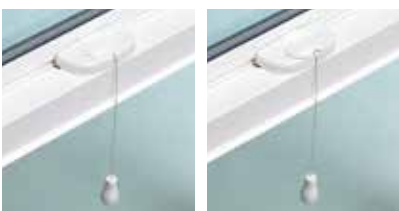
Optional ADA compliant PAL lock (shown locked and unlocked) with an adjustable pull cord to disengage the lock.