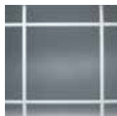
3/4" Contoured Prairie