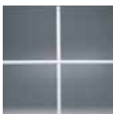
3/4" Contoured Colonial