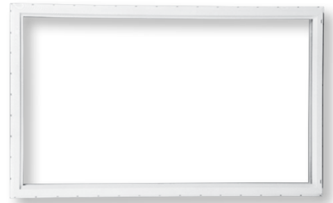
Transform the appearance of your home with eye-catching picture windows.

70 Series picture windows inspire visual appeal while expanding your outdoor viewing area. Picture windows invite the beauty of outdoors inside – without compromising the comfort and energy efficiency of your home. When you combine picture windows with fixed lites or special shapes, you'll create a focal point that lends distinctive style to your home, both inside and out.