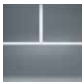
1" Contoured Craftsman