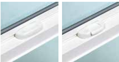
Optional PAL lock (shown locked and unlocked) makes it easy to close and lock the window in a single motion.

70 Series windows come standard with a 1-3/8" set back nail fin. For ideal installations in a variety of applications, four additional options also are offered.