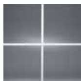
5/8" Standard Flat Colonial

Decorative grids will lend style and dimension to your windows. Classic grids are available in White, Almond and Desert Clay. All grid selections are offered in Colonial, Prairie and Craftsman patterns in a 5/8" standard flat grid, a 3/4" contoured grid and a 1" contoured grid.