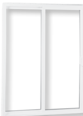
An integral full-length interlock provides increased strength and protection from energy loss.