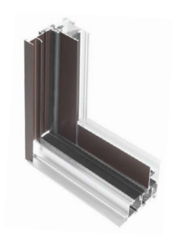
Black PVC threshold that tends to discolor and warp