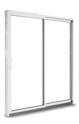
Door and sill two different colors