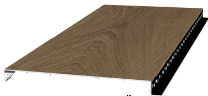
QUICK CLICK 6" SHADOWLINE SOFFIT 12', 16' & 20' LENGTHS