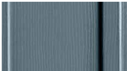
Cedar Mill Grain Texture

Lifetime Limited, Transferable Warranty** Your assurance of long-lasting quality and value.