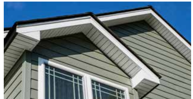
Performance G8 Flatstock in Bright White.

Aluminum's easy and infinite recyclability helps make it a more sustainable building material. The aluminum used in Gentek's flatstock contains >90% pre/post-consumer recycled content and is 100% recyclable. ††